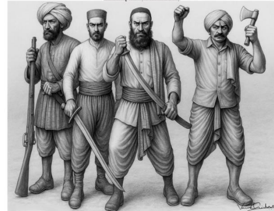
Sculptures - 4 Scene - Big diorama with sculptures of battle fought in Nirmal Ghats on 5th April 1860 in between Gonds, Rohillas and Deccanis led by Ramji Gond and Haji Ali on one side and the forces of the Taluqdar of Nirmal on the opposite side.