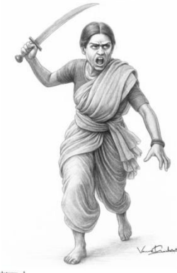
Sculptures - 1 Scene - Diorama of Sammakka fighting against Kakatiya forces in 1150AD.