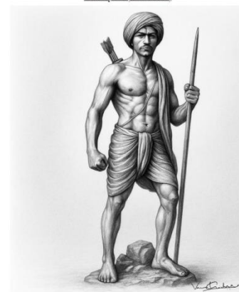
Sculptures - 1 Scene - Diorama with sculptures of Birsa Munda Guerrilla war at Dumharikonda, Bhukhand in January, 1900.