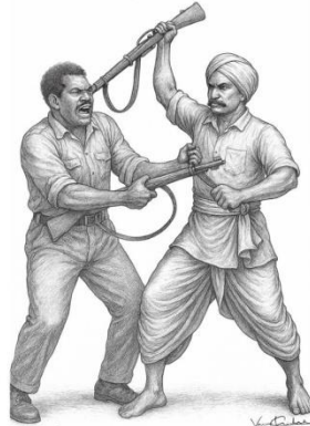
Sculptures - 2 Scene - Diorama of Jalebat ambush between the team of Komaram Bheem & Nizam's forces on 10/2/1930.