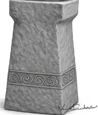
RAMJI GOND - THE TRIBAL FREEDOM FIGHTER MUSEUM -