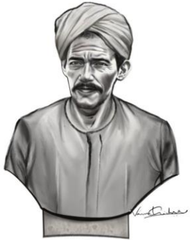
Kolam Kumram Sooru. Bust Size : 28" Inch.