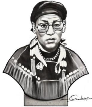
Indian Naga Spiritual & Freedom Fighter Rani Gaidinliu. Bust Size : 28" Inch.