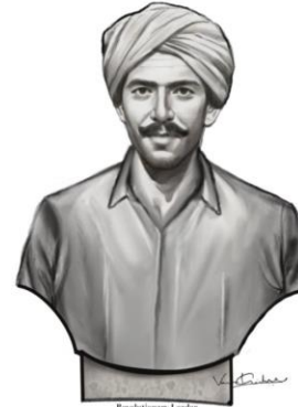
Revolutionary Leader Kumram Bheem. Bust Size : 28" Inch.