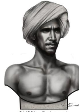
Tribal Religious, millenarian movement Birsa Munda. Bust Size : 28" Inch..