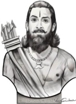
Indian Revolutionary Alluri Sitarama Raju. Bust Size : 28" Inch.