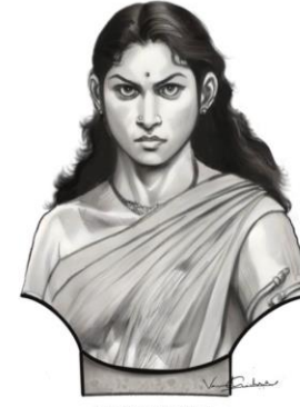
Revolutionary of Telangana Sammakka. Bust Size : 28" Inch.