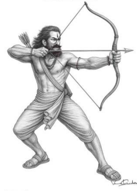
Sculpture - 1 Scene - Aluri Sittha Rama Raja attacking Chintalapudi police station in 1923.